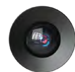
HD intelligent cameras