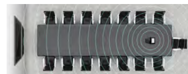
360° quad mic arrays

360° quad microphone arrays, beamforming technology and mic pods pick up every word. High-precision, HD intelligent cameras with 150° field of vision do everything from focusing on who's speaking to counting who's in the room.